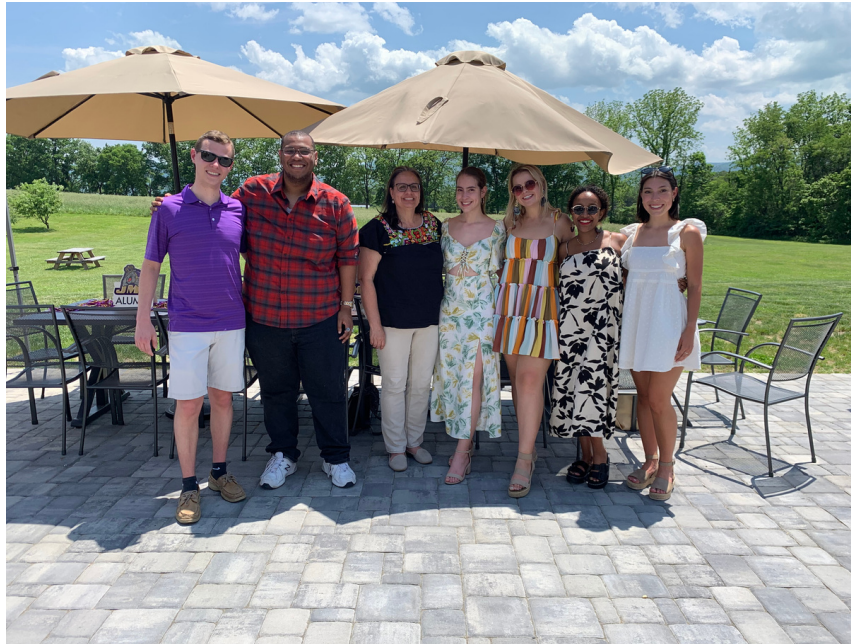
Celebrating the class of 2022 at Brix and Columns